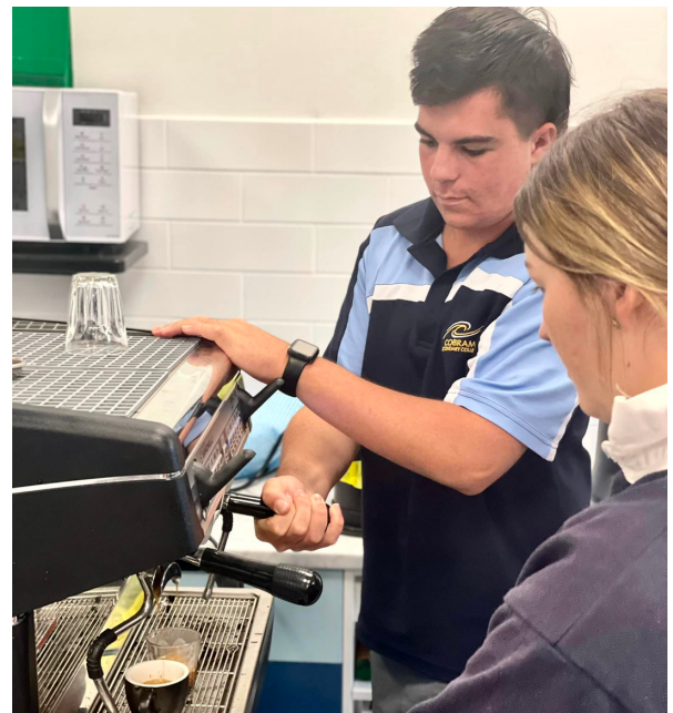
The students complete their barista certificate.