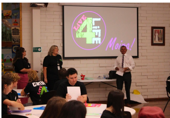
Live 4 Life Youth participation day