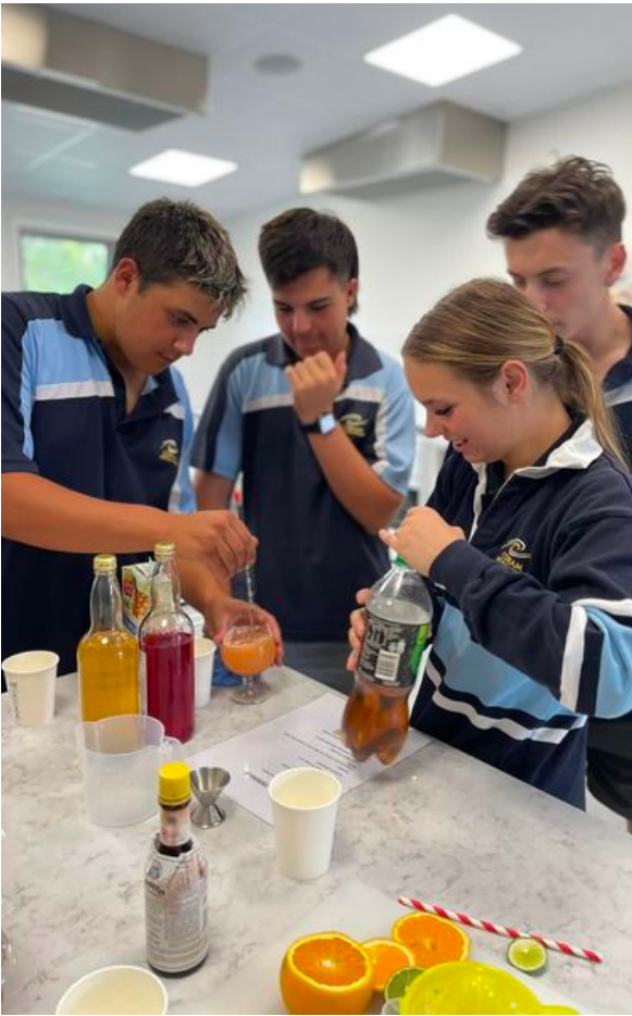
The students in job camp completed their certificate in making non-alcoholic beverages

JOB CAMP is facilitated by way of incursion and offers students access to vocational training and compliance certificates that are pre-requisites for employment.