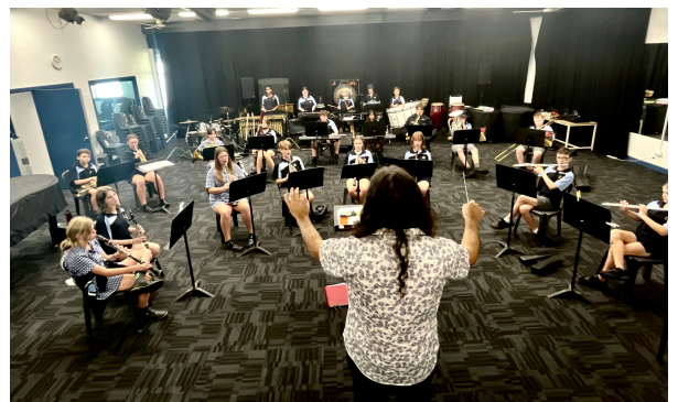
Junior band practice