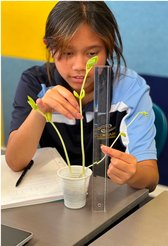
Learning about photosynthesis

It hasn't taken the year 7's long to settle in, make new friends & learn new things