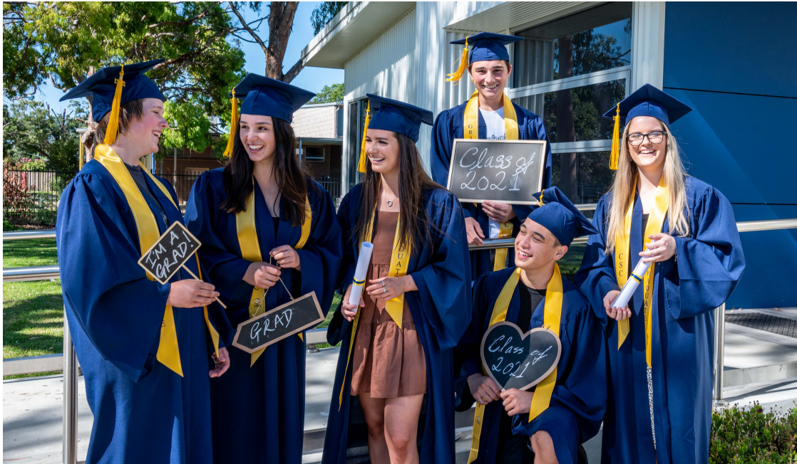
Class of 2021 celebrate