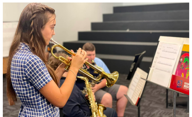
Jazz band practice