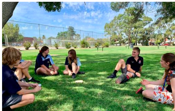
Mentor groups meet every Tuesday

The Student Mentor Groups Initiative was established to improve the wellbeing and school community connectedness. Each staff member of CSC (teacher and ES Staff) is provided a small number of students (6-9 students) that they will 'mentor' for the year. In response to the impact the pandemic has had on student mental health and wellbeing; the College, through student data analysis and consultation with the wider school community recognised the need to prioritise student sense of belonging. Students will meet their 'Mentor group' once a week for roughly 20 mins in an allocated space of the school to chat, check in and discuss anything they desire socially, emotionally, goal or education related.