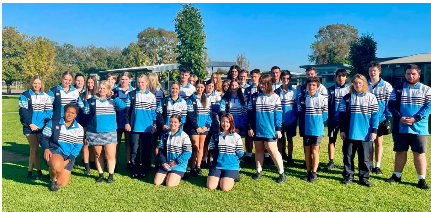
Year 12's wear their new tops with pride!